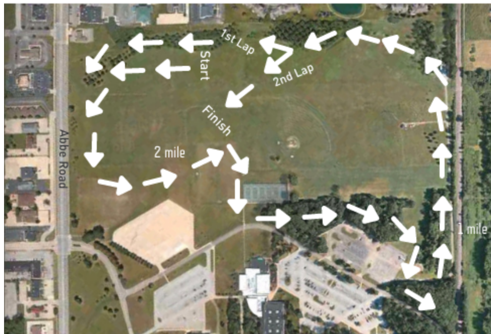
High School 3.1 Mile Cross Country Map